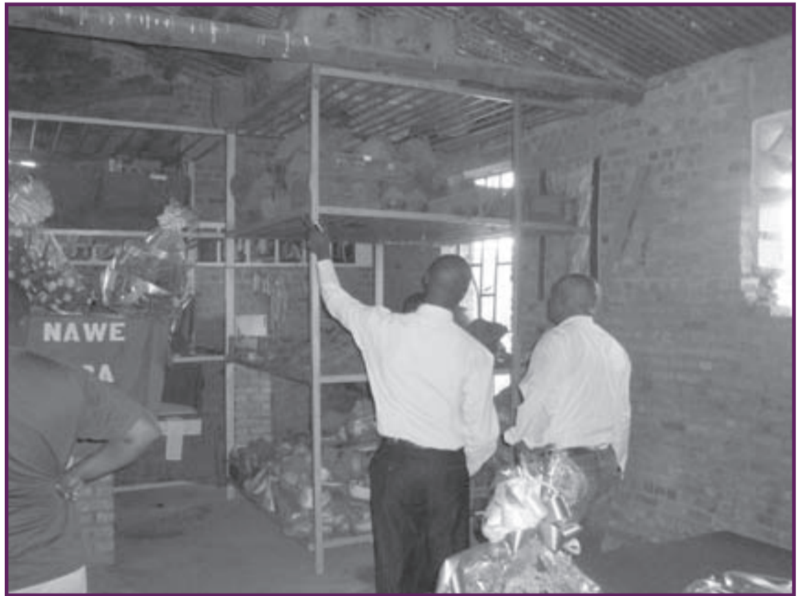
Gusura inzibutso ni uburyo bumwe bwo kwibuka Jenoside yakorewe Abatutsi.

Uwo muni, nk'uko abagize Akagari ka Cyugaro bari batangiriye icyunamo ku rwibutso rwa Ntarama, no kugisoza niho byabereye. Uwatanze ikiganiro muri uwo mwanya, akaba yarasabye Abanyarwanda kutibuka