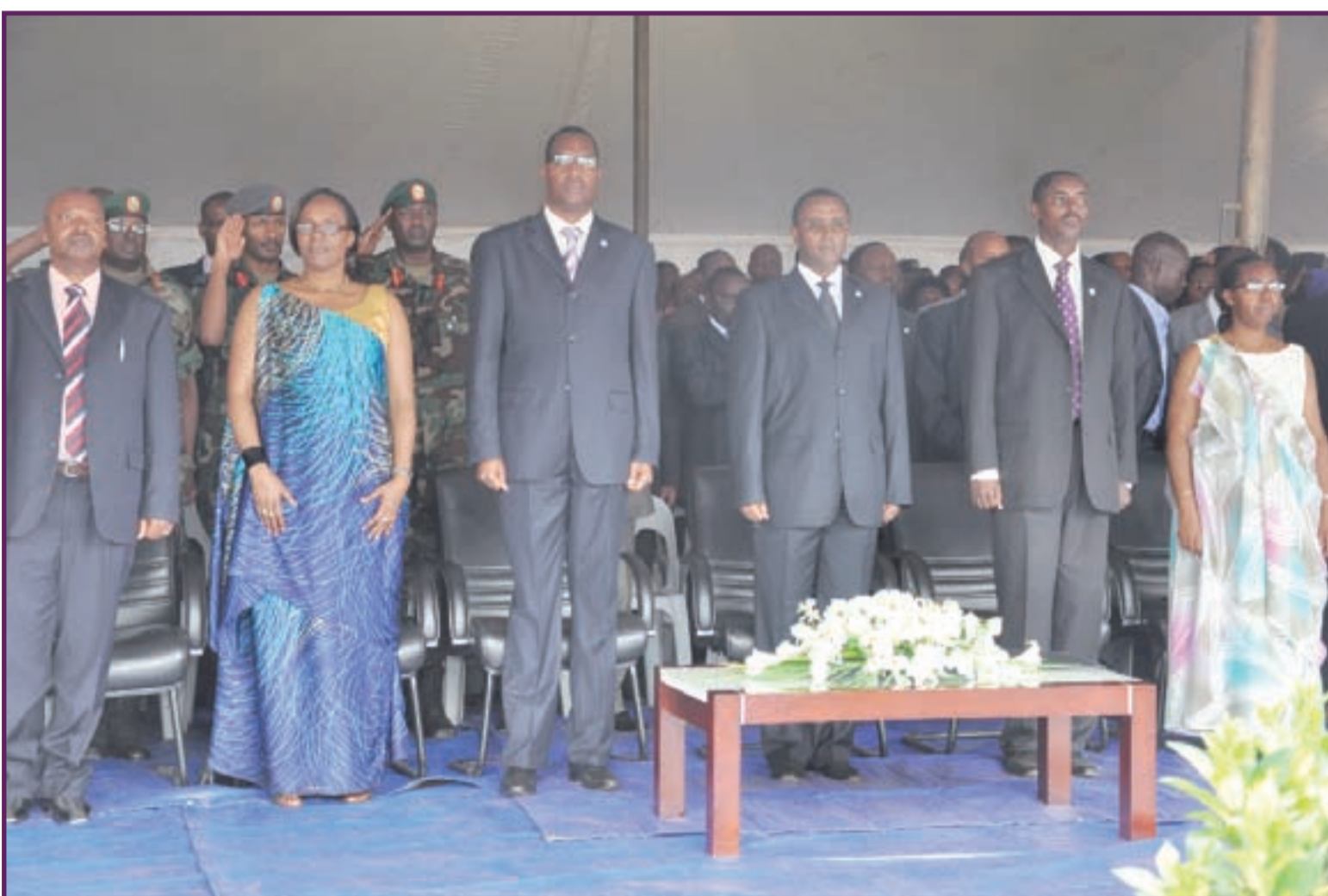
Abayobozi bakuru bifatanyije n'Abanyarwanda mu muhango wo gusozza icyumweru cy'icyunamo.

Icyumweru cy'icyunamo no kwibuka Jenoside yakorewe Abatutsi ku nshuro ya 17 cyari cyatangijwe na Perezida wa Repubulika Paul Kagame ku itariki ya 7 Mata 2011, cyasojwe no kwibuka abanyapolitiki bazize Jenoside yakorewe Abatutsi bashyinguye ku rwibutso rwo ku i Rebero. Insanganyamatsiko yagiraga iti : "Dushyigikire ukuri, twiheshe agaciro." Icyo cyumweru cyaranzwe n'ibikorwa bitandukanye byo kwibuka birimo ibiganiro byatanze, amafilime yerekanywe, ibikorwa byo gusura no gusukura inzibutso, ibijyanye no gufasha abacitse ku icumu rya Jenoside yakorewe Abatutsi gucyemura ibibazo by'imibereho no kubihanganisha.