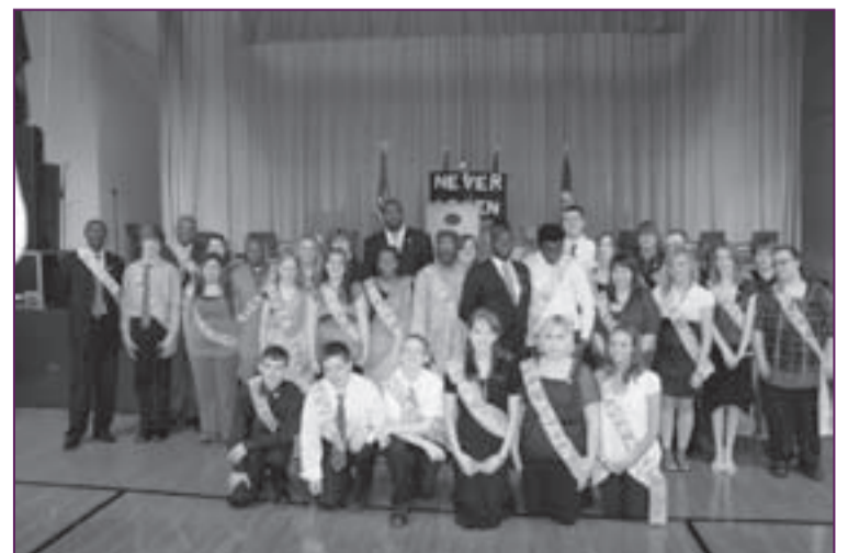
Bamwe mu bari bitabiriye umuhango wo kwibuka Jenoside yakorewe Abatutsi wabereye mu ishuri rya Decatur Discovery Academy rihereye Indianapolis muri USA