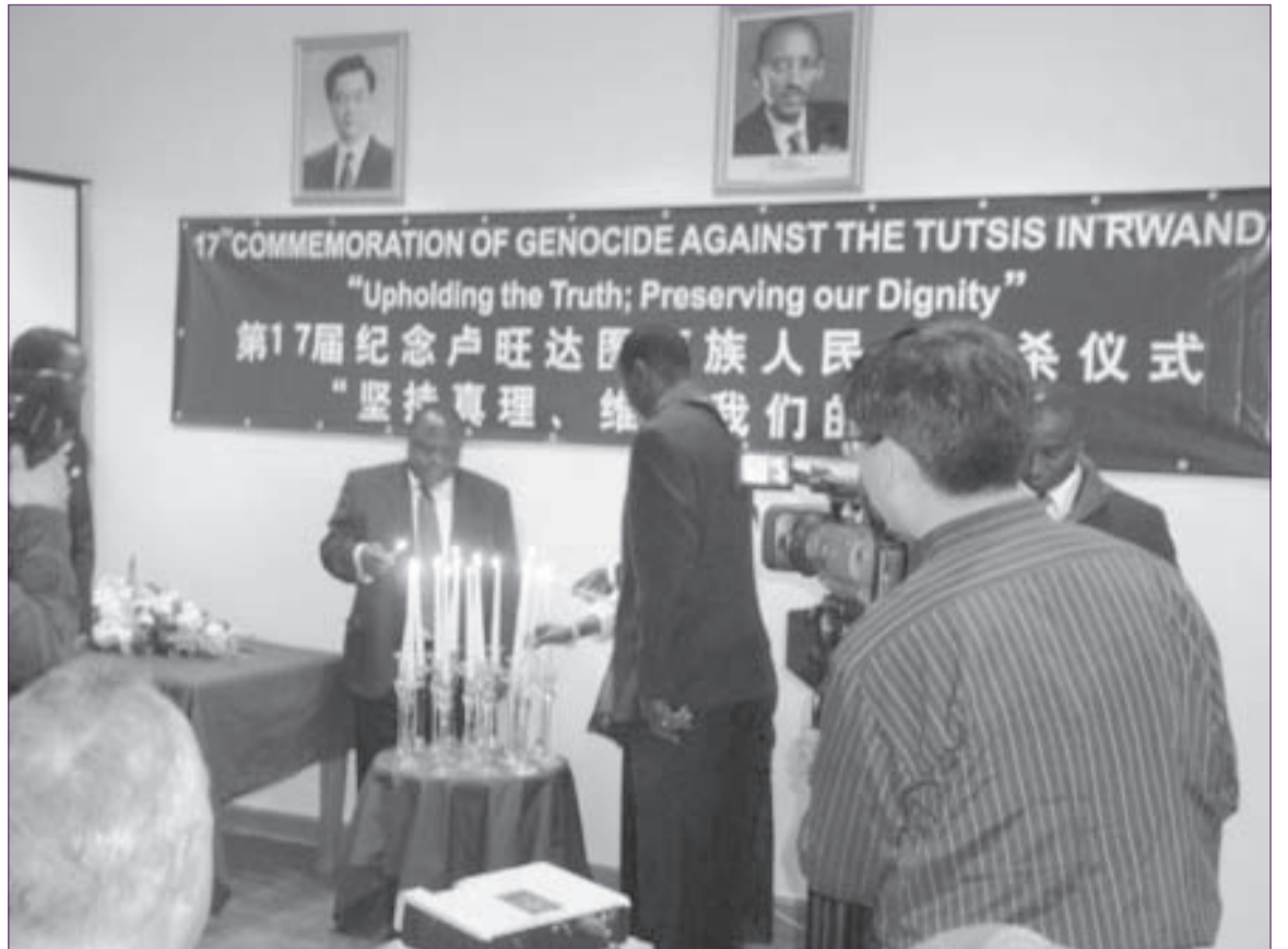
I Pekin mu Bushinwa, umuhango wo kwibuka wabanjirijwe no gucana urumuri rw’icyizere.

(...) URwanda, magingo aya rurimo kwivana mu murage rwasigiwe na Jenoside yakorewe Abatutsi, rushakira umuti ibibazo abacitse ku icumu rya Jenoside bafite, kandi rugerageza kubanisha neza abaturage barwo bose, rushaka ibisubizo ku bibazo by’ubukungu(...). Nk’uko insanganyamatsiko y’uyu mwaka idusaba ngo “Dushyigikire ukuri, twihesheagaciro”, twiyemeje ko ibyiza tumaze kugeraho