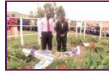
I Nyarubaka muri Kamonyi, ahashyinguye inzirikarengane.....Urup.15