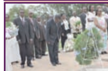
Ku i Rebero, bunamiye abahoze ari abanyapolitiki.....urup2