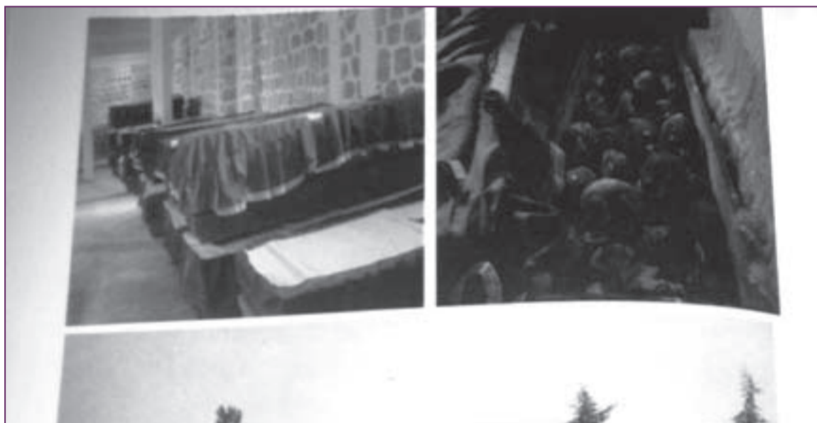
Imva y'Urwibutso rwa Mugina