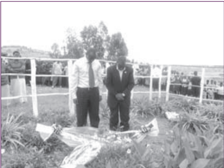
Ahari imibiri y'abishwe muri Jenoside i Nyarubaka ntiharatunganywa

Ibyo byagaragajwe n'umugore umwe watanze ubuhamya, ubwo ku itariki ya 28 Mata, ku Murenge wa Nyarubaka, ho mu Karere ka Kamonyi bibukaga inzirikarengane z'Abatutsi 1371, bishwe muri Mata 1994 bakaba bashyinguye ku rwibutso rwa Nyarubaka.