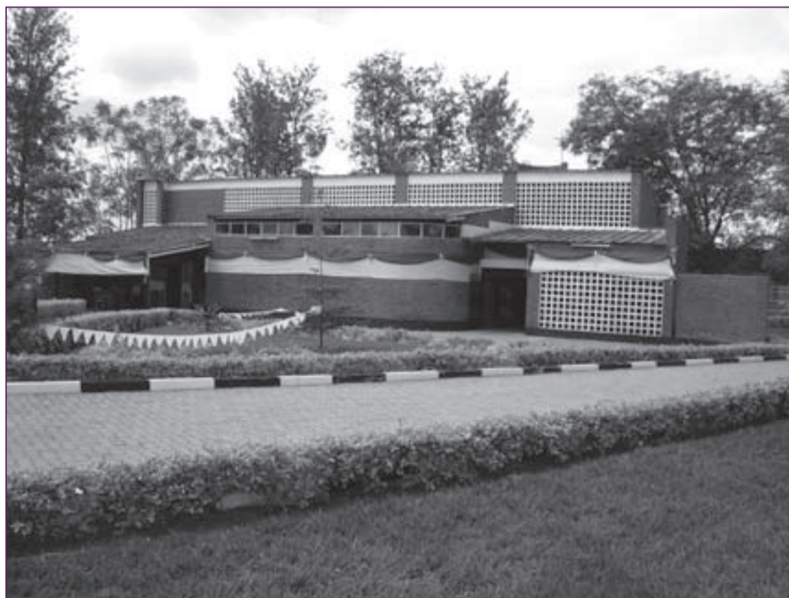
Bimwe mu byaranze Jenoside yakorewe Abatutsi ni uko abantu biciwe muri za Kiliziya, nk’iyi y’i Nyamata

Ariko noneho bigeze 1990 bakaza umurego, ubwo hatangiraga urugamba rwo kubohora u Rwanda rwatangiye ku wa 01/10/1990. Abanyabugesera batangiye komeza ku rup.19