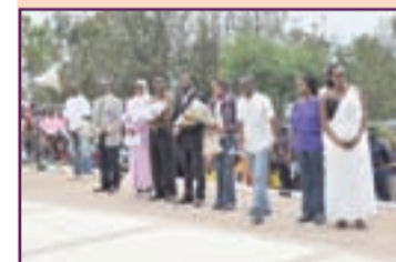
Abo basize bazusa ikivi.....urup3