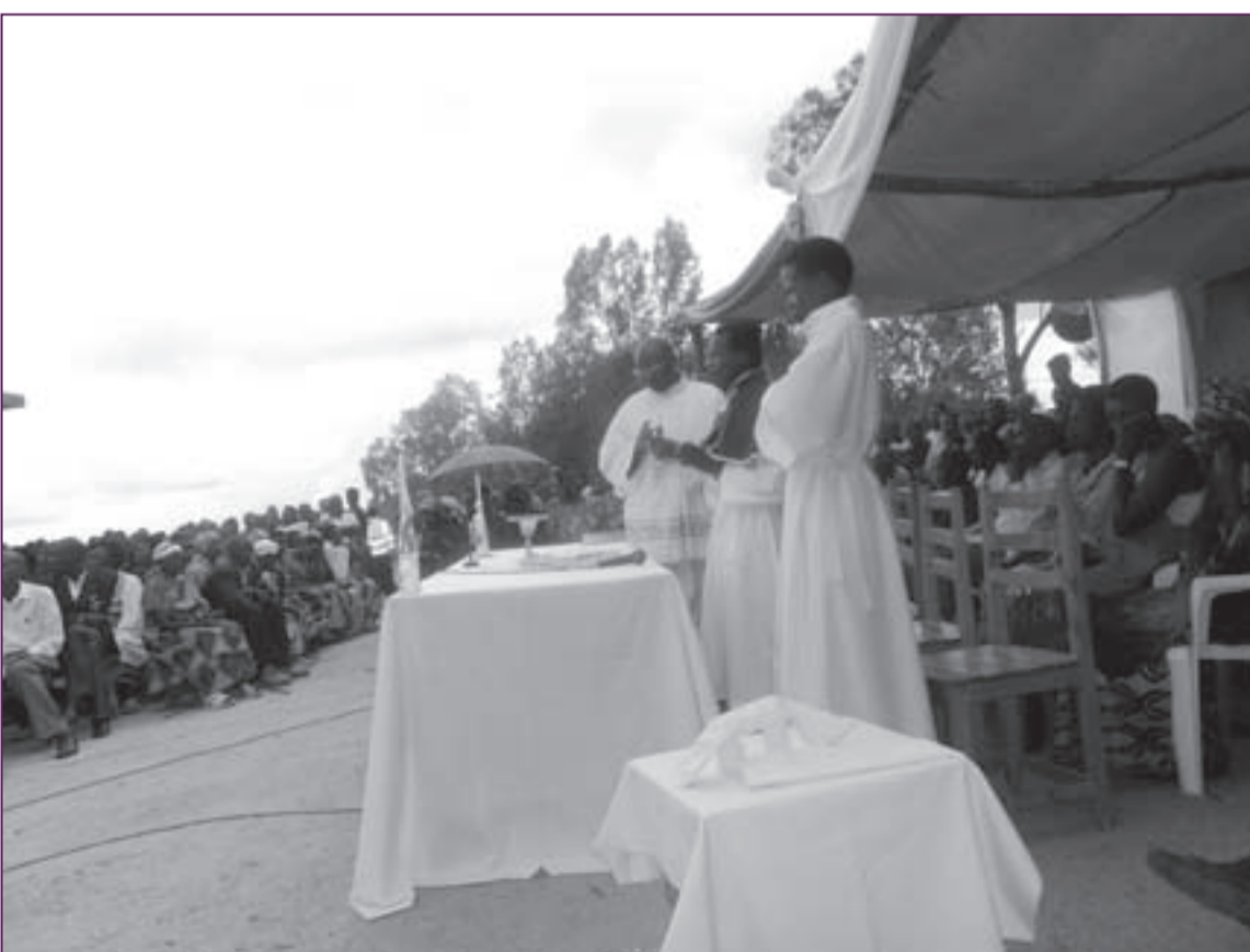
Igitambo cya misa nicyo cyabimburiye imihango yo kwibuka.