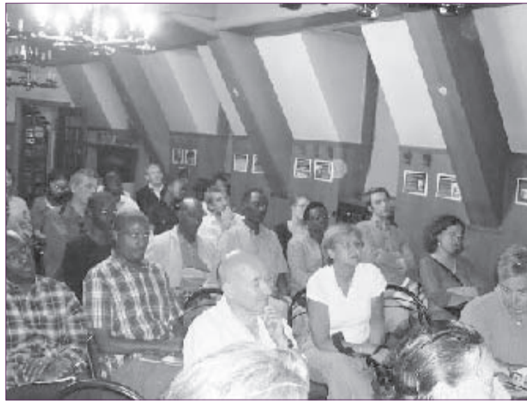
Mu Bubiligi, igikorwa cyo kwibuka nticyahariwe Abanyarwanda babayo, bamwe mu benegihugu barabayagiye.

Kuwa kane tariki ya 7 Mata, Umuhango wo kwibuka Jenoside yakorewe Abatutsi wabereye Woluwe St Pierre, witabiriwe n'uhagarariye Umuryango wa Diaspora mu Bubiligi, uhagarariye Leta y'igihugu cy'Ububiligi n'abandi barimo aba Ambasaderi b'ibihugu by'Umuryango Acp(Afrique, Caraïbes et Pacifique)ukorerariBruxelles, uhagarariye DRB-Rugari bivuga Diaspora Rwandaise de Belgique n'abandi banyacyubahirwa barimo Bourgmestre w'Umujyi wa Woluwe St Pierre.