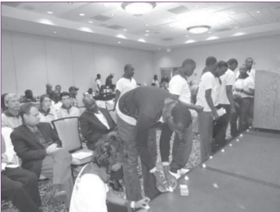
Bamwe mu banyeshuri biga mu gihugu cy'Amerika (USA), mu gikorwa cyo kwibuka.