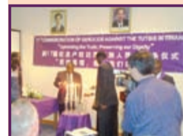
No mu Bushinwa baributse.....urup9