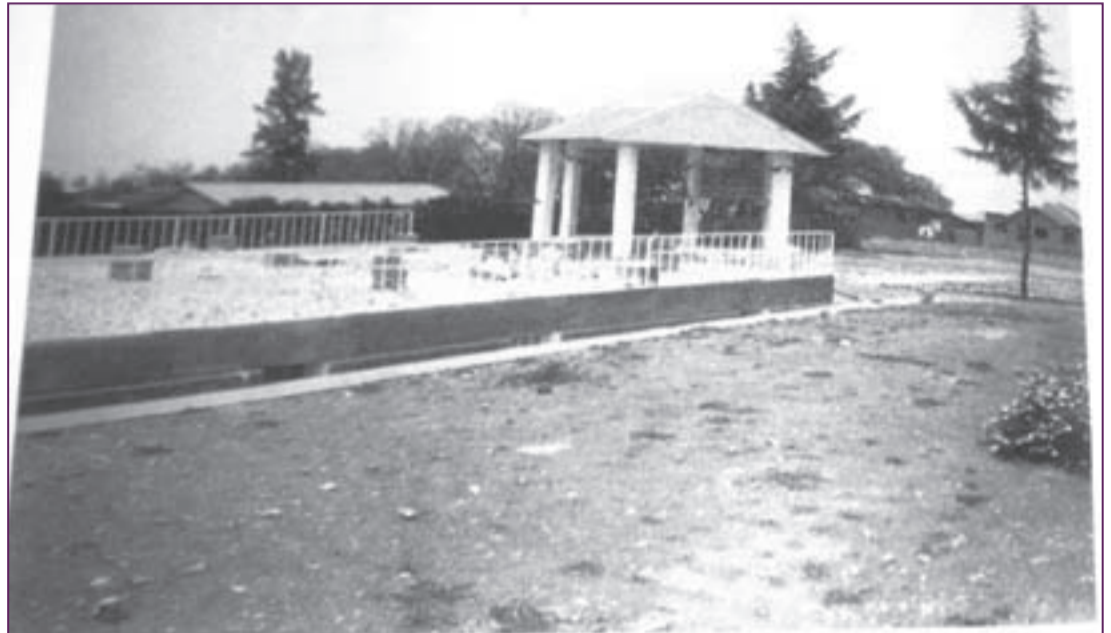
Inzu n'ubusitani bw'urwibutso rwa Mugina