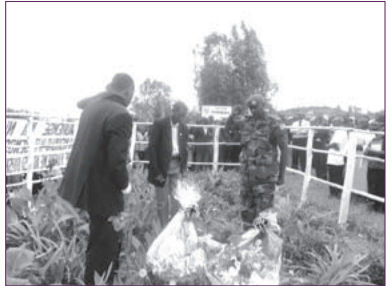
Inzirakarengane zazize Jenoside i Nyarubaka, zirimo abazijijwe ubwoko no kuba abahungu

Twabajije umukozi wa Komisiyo y'igihugu ushinzwe kwibuka niba hari ahandi bazi cyangwa bamenyeshwe mu gihugu habaye igikorwa cya Jenoside nk'icyo cyo kwica abana b'abahungu mu rwego rwo gusibanganya ubwoko bw'abatutsi asubiza inshuro zose habayeho igikorwa cyo kwibuka Jenoside yakorewe Abatutsi kugeza kuri iyi neuro ya 17 nta hantu yari