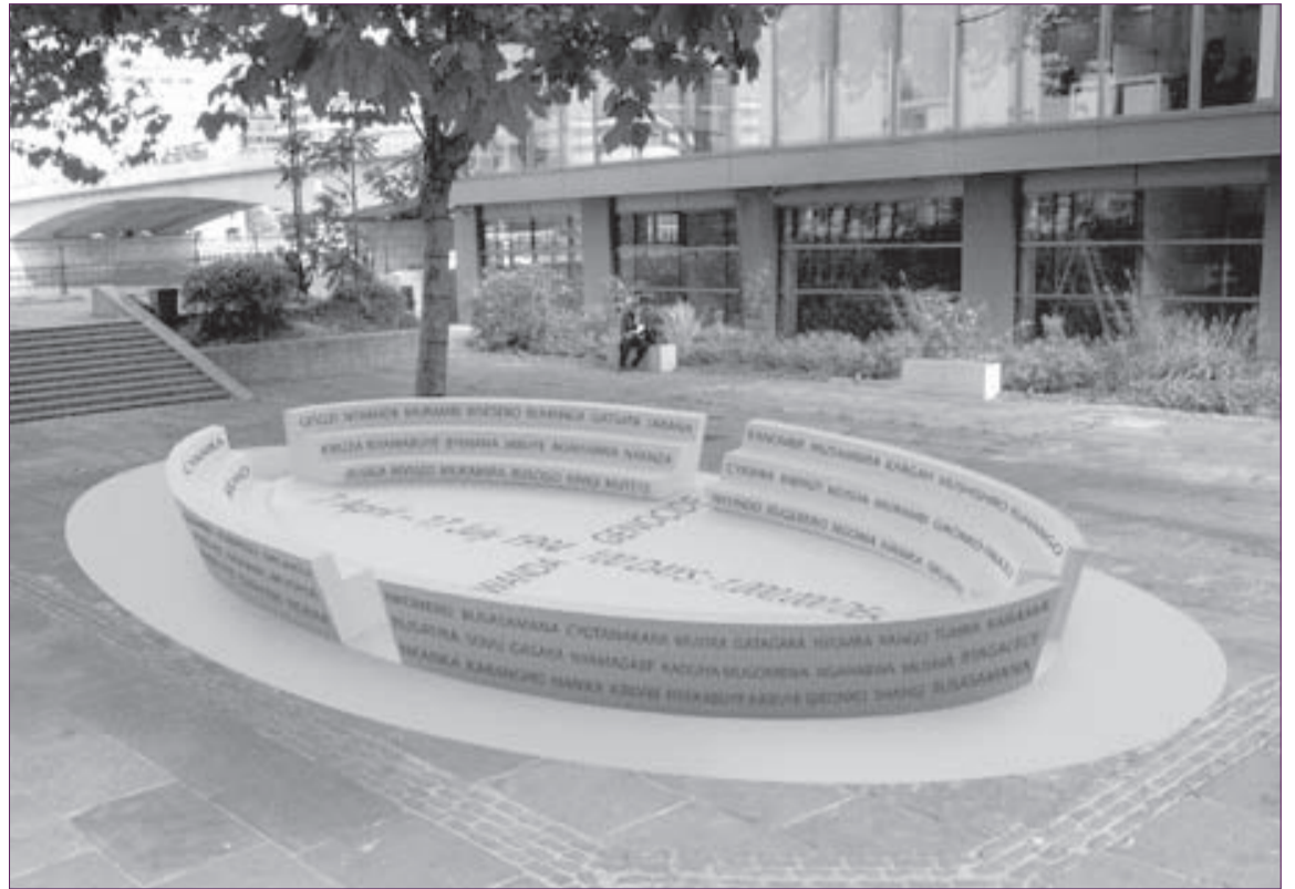
Iki ni igishushanyombonera cy'urwibutso rwa Jenoside yakorewe Abatutsi ruzubakwa i Londres mu Bwongereza