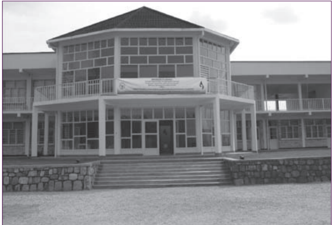
Ntibasuye uru rwibutso gusa banasuye na zimwe mu mfubyi za Jenoside yakorewe Abatutsi zo muri Nyamagabe

Bahavuye biyemeje gufasha izo mfubyi kwifasha