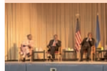
Muri Amerika, bibutse bari kumwe n'abaturutse mu Rwanda .....Urup11