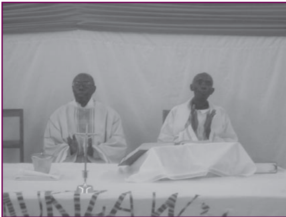
Umuhango wo gutangiza Gakwavu Foundation wabimuriwe na Misa.

Abo bana bakimara gukurwa mu nkambi ya Nyarushishi bimuriye I Kamembe mu Kigo cy'amashuri yisumbuye cyizwi ku izina rya APPEEDUC aho bageragezaga guhabwa ubufasha bw'amarenzamu n'umuryango utegamiye kuri Leta witwaga MEDECINS DU MONDE.