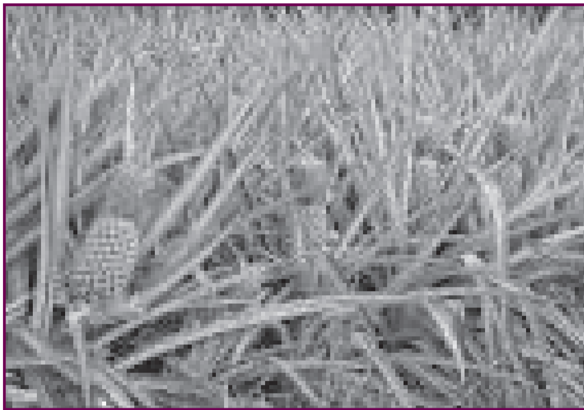
Ubuhinzi bw'inanasi ni kimwe mu kitabiriwe n'amashyirahamwe y'abacitse ku icumu yo mu Karere ka Ngororero.

Abacitse ku icumu rya jenocide yakorewe Abatutsi mu 1994 bomukarereka GAKENKE ngo biyemeje gusezerera ubukene n'ubwigunge. Ibi bigaragazwa n'uko usanga baragiye bibumbira mu mashyirahamwe agamije kwiteza imbere. Amwe muri ayo mashyirahamwe usanga ari ayinjiza amafaranga andi akaba ari ayo guhana amafaranga hagati yabo. Nkuko abo twaganiriye babyivugira ngo aya mashyirahamwe uretse kubafasha kubona amafaranga yo kwikenura atuma babona n'umwanya wo kuganira bakungurana ibitekerezo, atuma babasha kwirinda ihungabana kandi akababera n'inzira y'ubwiyunge.