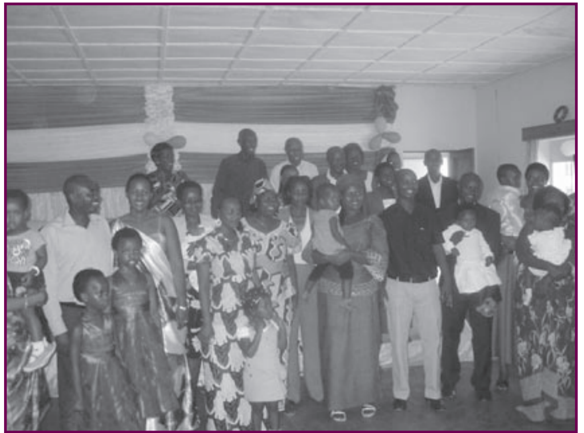
Bamwe mu bari bitabiriye umuhango wo gutangiza Gakwavu Foundation

Bavuye muri icyo kigo bajya kurererwa mu miryango yabakiriye Mu mwaka w'i 2000, hashingiwe kuri gahunda ya Leta ko buri mwana akwiye kugira umuryango arererwamo, ikigo cya «CENA» cyohereje abana mu miryango itandukanye yabakiriye mu rwego rwo gukomeza uburere bwabo, abandi bamaze kwigira ejuru bashinze iyabo miryango y'abana bibana, nuko ikigo cyabahuzaga gisubirana gahunda yacyo yo kurereramo abitegura kwiye gurira Imana. Ibyo byatumye abana batatana n'ubwo abo bihaye Imana (Aba