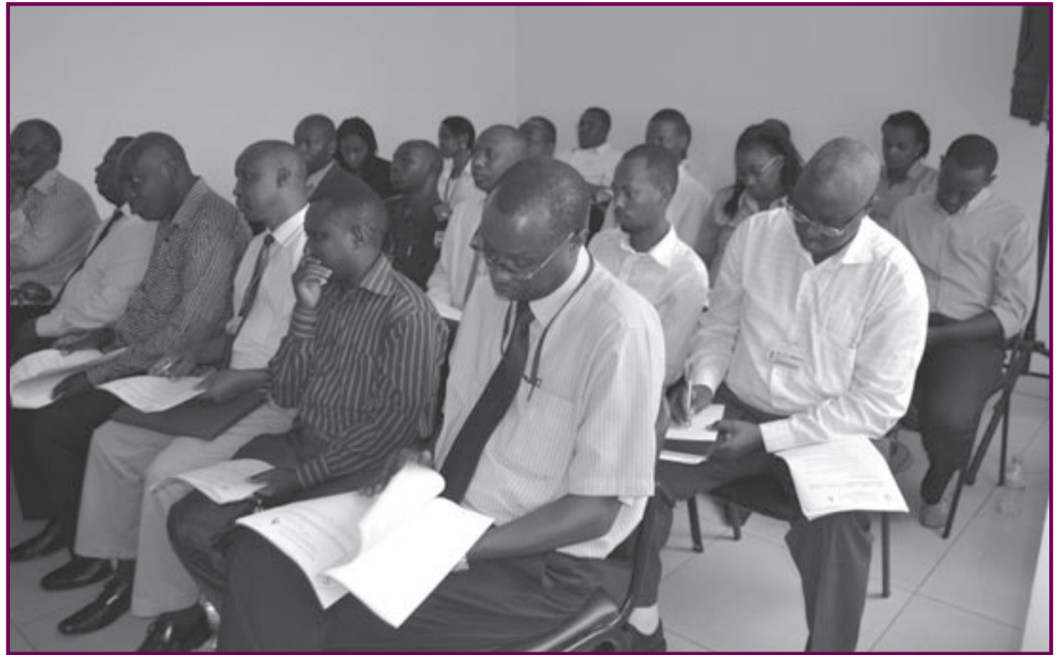
Bamwe mu bitabiriye inama nyunguranabitekerezo ku kwibuka ku nshuro ya 18 Jenoside yakorewe Abatutsi

Kuri ibi byerekeye ibiganiri, hari abanyarwanda baba mu mahangabasabyeko Komisiyo y'igihugu yabateganyiriza ibiganiri. Umunyamabanga