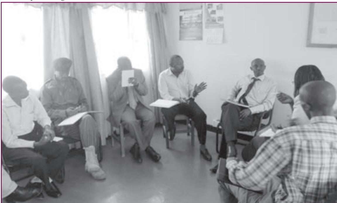
Inzego zari zihagarariye mu gucoca ikibazo ni : CNLG, Hoteli Serena, Akarere ka Rubavu, Ibuka, Ubuyobozi bw'Ingabo, Ubuyobozi bwa Police, ubuyobozi bw'Ubushinjacyaha mu Karere ka Rubavu.