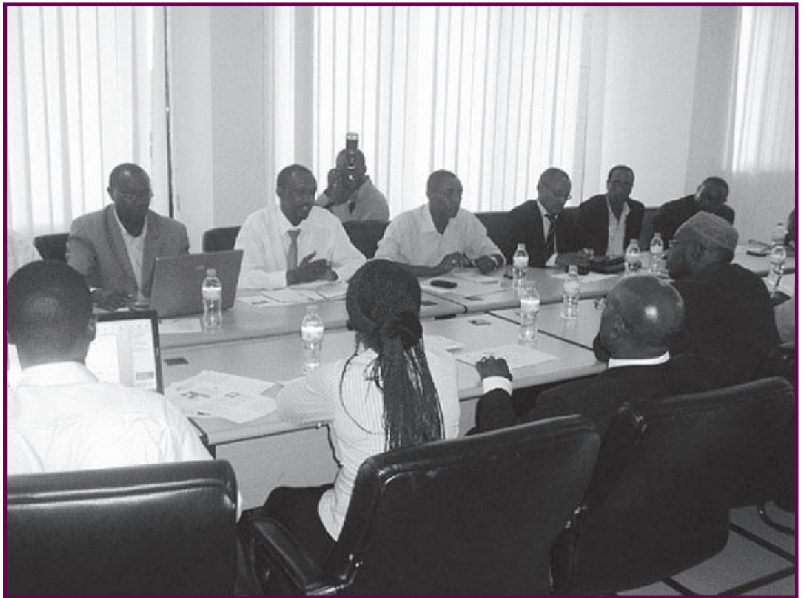
Abanyarwanda baba mu mahanga bagiranye ibiganiro na CNLG

Ibyo babigaragarije mu nama bagiranye n'abakozi ba Komisiyo y'igihugu yo kurwanya Jenoside ubwo basuraga CNLG ku itariki ya 3/ 1/2012.