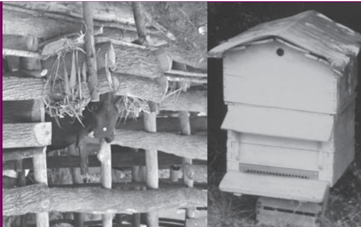
Ntibagitekereza ubworozi bw'inka gusa, barashakira no mu bw'inzuki.