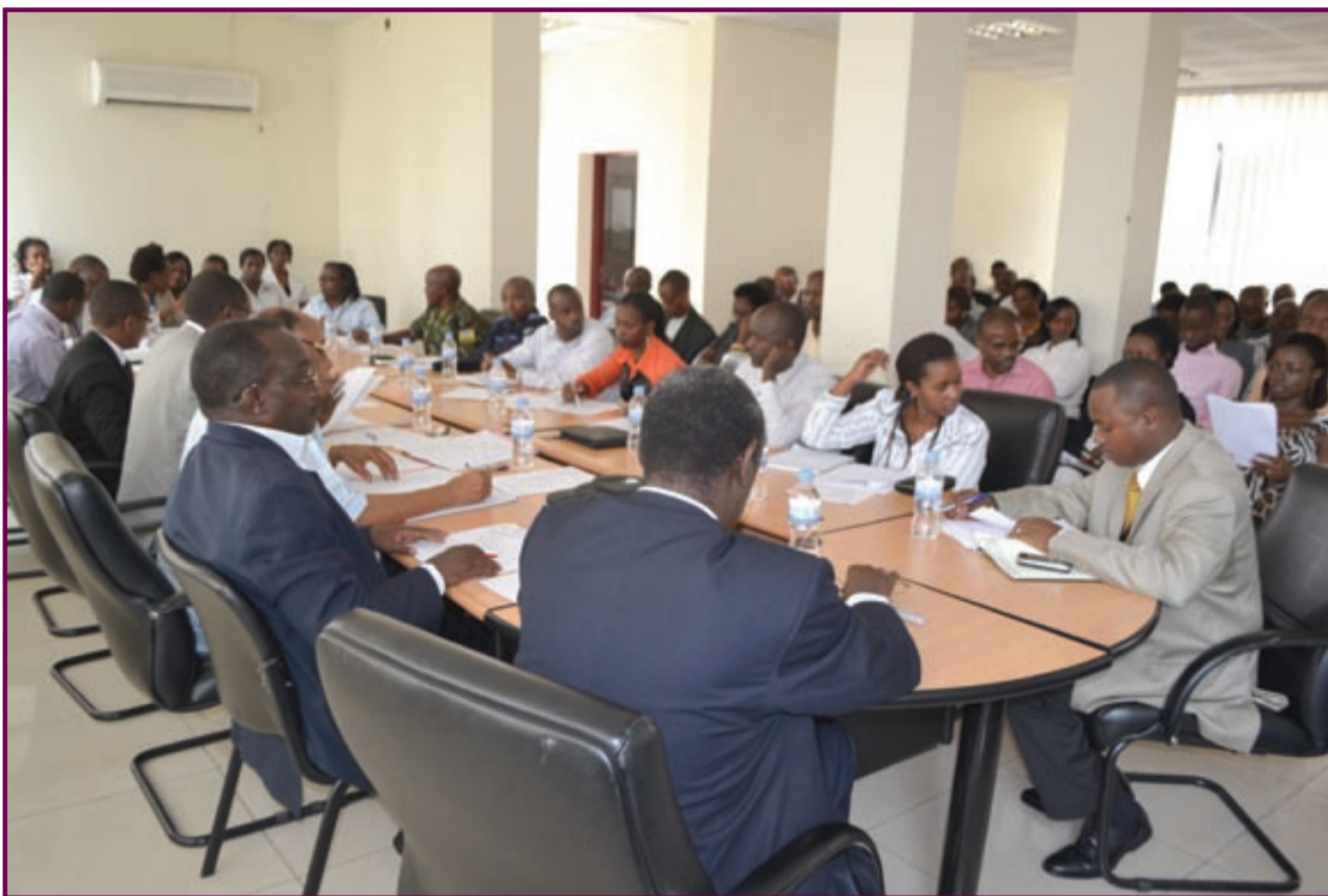
Abari mu nama bunguranye ibitekerezo ku buryo bwo kunononsora imihango yo kwibuka ku nshuro ya 18 Jenoside yakorewe Abatutsi

Inama ya Kabiri yo gutegura kwibuka ku nshuro ya 18 yabereye ku cyicaro cya Komisiyo y'igihugu yo kurwanya Jenoside (CNLG) ku itariki ya 26 Mutarama 2012, ihuza abakoze b'iyo Komisiyo n'abahagarariye inzego zinyuranye zisanzwe zifatanya na CNLG gutera igikorwa cyo kwibuka. Abari muri iyo nama ikurikira iya mbere yari yabaye mu kwezi kwa cyenda umwaka ushize, bamenyeshajwe insanganyamatsiko y'uyu mwaka ariyo « Kwibuka Jenoside yakorewe Abatutsi : « Twigire ku mateka, twubaka ejo hazaza ».