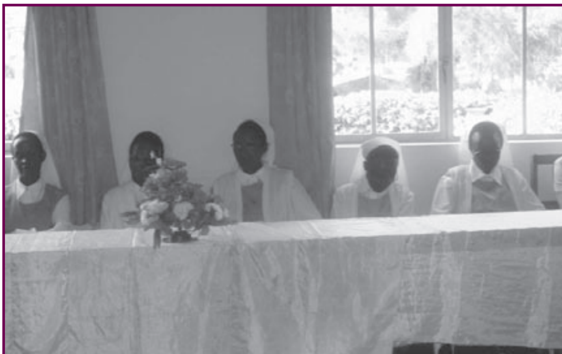
Misa yabimburiye itangiza rya Gakwavu Foundation yitabiriwe n'abihayimana benshi.