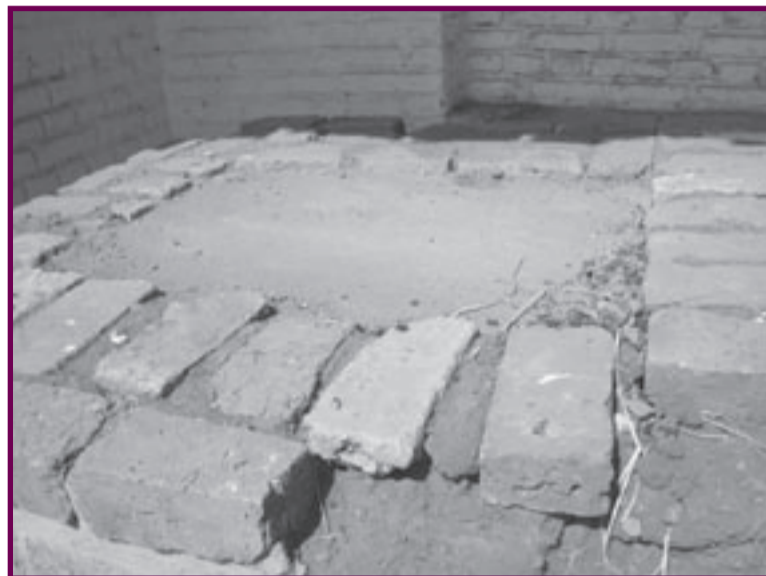
Hamwe mu hari imibiri idashyinguye neza, muri Ngoma na Kirehe

Abafite ababo bashyinguye mu nzibutso zisanze za Jenoside (iz'igitaka) twaganiriye, bose nta kibazobafite kijyanye n'uko iyo mibiri yakwimurwa. Iyo uhageze barakubaza ngo abantu bacu muzabimura ryari ko aho bari hagayitse.