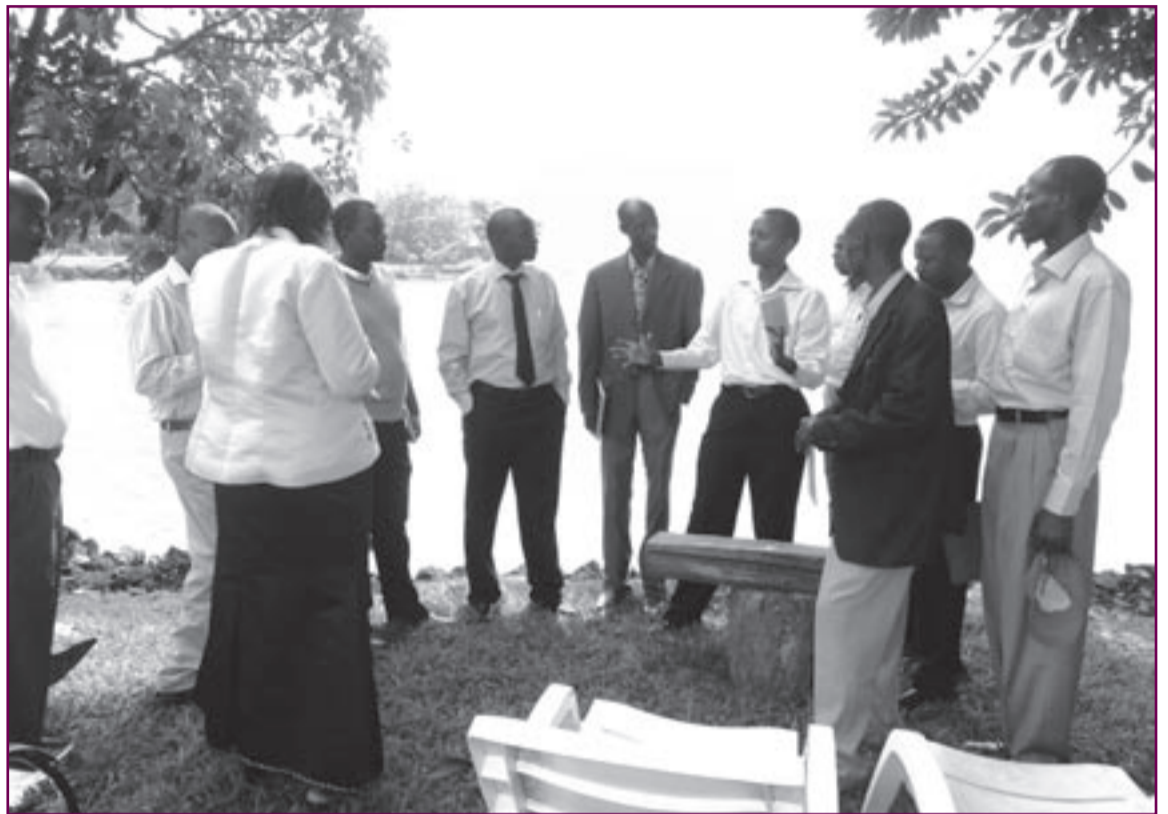
Ubuyobozi bwa Serena n'abahagarariye inzegoza Leta bacoca ikibazo

Ku itariki ya 17 na 18 z'ukwezi kwa Mutarama 2012 mu Karere ka Rubavu hateraniye inama yahuje inzego zinyuranye harimo abahagarariye Komisiyo y' Igihugu yo kurwanya Jenoside, ubuyobozi bwa Hotel Serena-Gesenyi, Ubuyobozi bw' Akarere ka Rubavu, Ibuka, ubuyobozi bw'Ingabo, Ubuyobozi bwa Police n'Ubuyobozi bw'Ubushinjacyaha mu Karere ka Rubavu. icyaganiriwe ni gahunda y'ukuntu hajya hibukwa Abatutsi bishwe muri Jenoside yakorewe Abatutsi baguye muri hoteli Serena Gisenyi (former Hotel Merdien Izuba), uburyo hashakishwa amakuru agaragaza ahakiri imibiri muri iyo hoteli, kugira ngo ikurwemo ishyingurwe mu cyubahiro, kimwe no gushyira "plaque" ahakuwe imibiri 12.