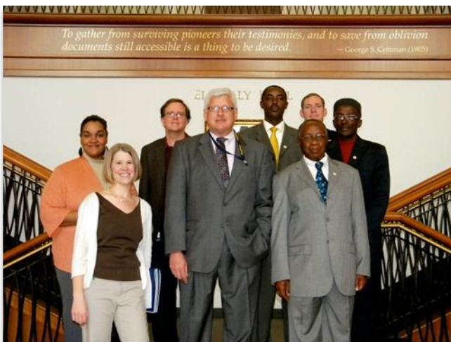
At the Indiana Historical Society delegates were moved by the theatrical presentation of the speech given in Indianapolis by Robert F. Kennedy on the day of the assassination of Martin Luther King and expressed how relevant such forms of theater are in not only commemorating an important occasion, but also in continuing to educate the population at large on our priorities for commemorating and learning from the past, in building a better tomorrow.